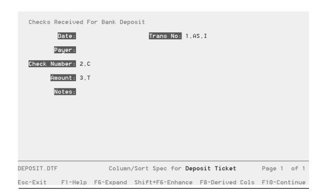
Figure 3. The Column/Sort Spec.

Tom Marcellus is editor of The Quick Answer.