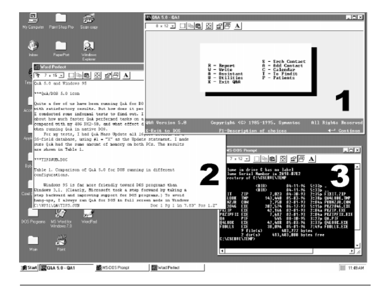
Figure 1. Your editor's typical Windows 95 desktop with Q&A (1), WordPerfect (2), and DOS (3) sessions running simultaneously in their own custom-sized windows. I can click on any window to bring it's program to foreground, and press Alt-Tab to run it in full screen mode.