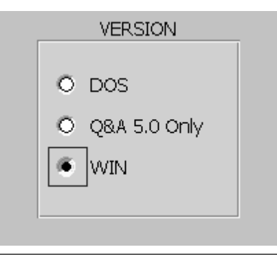
Figure 6. A Sesame Radio Button Group.