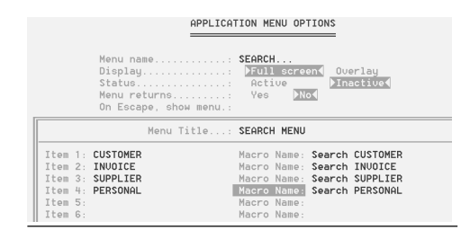
Figure 4 . Menu items and their macros, previously recorded.

You have now a fully-working custom menu. To search, you display this menu, select one of the items and press Enter. The Menu can be made even easier to use by assigning a hot-key to each macro name. To do so, return to